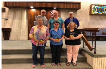
"Help one another is part of the religion of our sisterhood" Louisa May Alcott

Please call Temple Beth Or Office: 732-458-4700