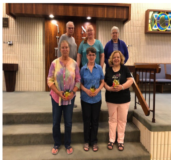
"Help one another is part of the religion of our sisterhood" Louisa May Alcott

Please call Temple Beth Or office: 732-458-4700