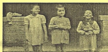
A Jewish girl and her Chinese friends in the Shanghai Ghetto, from the collection of the Shanghai Jewish Refugees Museum