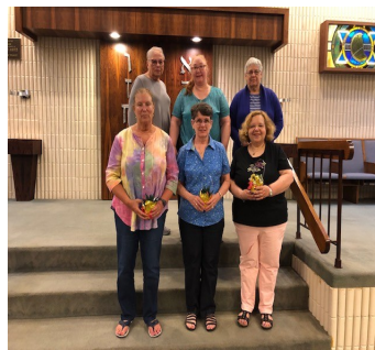
"Help one another is part of the religion of our sisterhood" Louisa May Alcott

Please call Temple Beth Or Office: 732-458-4700