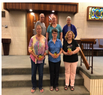
"Help one another is part of the religion of our sisterhood" Louisa May Alcott

Please call Temple Beth Or office: 732-458-4700